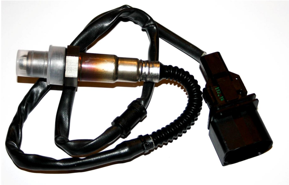
Abb. 3: LSU4.2