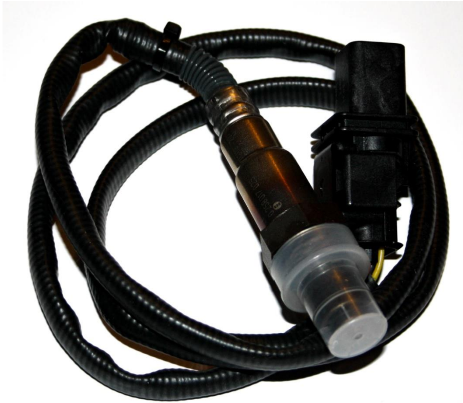
Abb. 4: LSU4.9