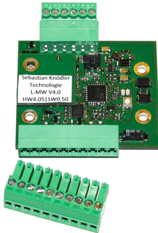
Abb. 1: L-MW V4.0 12V S